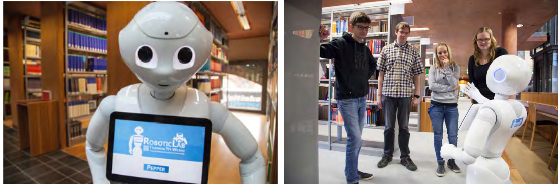
Figure 1: A special library assistant in action

was triggered additionally, since the team of the library planned to open up as a 24/7 – library. 8 Additional help in the field of user service would have been highly appreciated by the library team. Could a humanoid robot like Pepper fill this gap? The team of the library was motivated to figure it out. In September 2016, two Pepper robots were purchased, one for development and one for productive use within the library. The team of the RoboticLab Telematics 9 as a long-term partner of the library has shared this vision since then and taken over the responsibility for the technical development of the applications necessary to turn the described vision into reality.